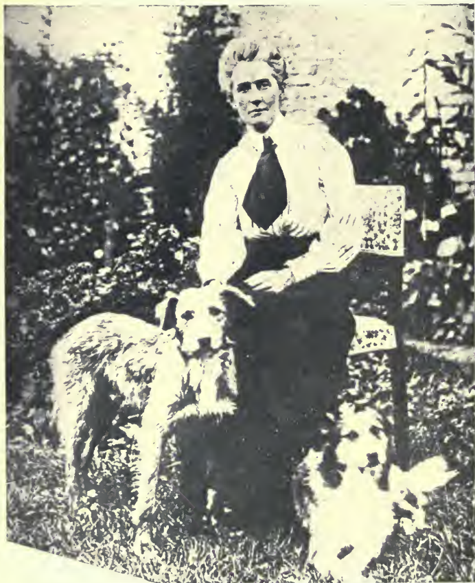
An interesting picture of Edith Cavell taken a few days before the tragic events which ended in her execution.