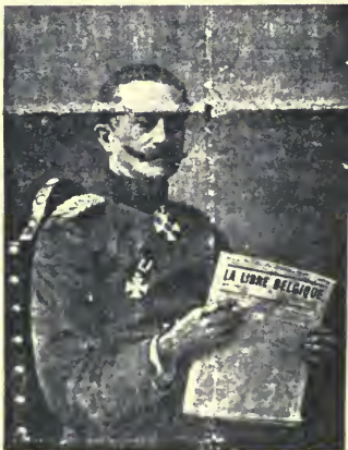
NOTRE CHER GOUVERNEUR, FORCÉ PAR LA LETTRE DE BISMARCK DE SE TAIRE, ENFIN, CHERME LA VÉRITÉ DANS LA LIBRE BELGIQUE

On nous fait à nouveau l'honneur de s'occuper de notre modeste bulletin. Nous en sommes flattés, mais nous nous voyons forcés de répéter ce que nous avons déjà dit pour votre défense. Ce n'est certes pas nous qu'on peut accuser d'attacher à la vérité, de provoquer nos concitoyens à la révolte. Nous ne manquons pas une occasion de prêcher la patience, l'endurance, le calme et le respect des lois de la guerre. Aussi profitons-nous de cette occasion qui nous est offerte pour répéter l'aria que nous avons déjà tué :