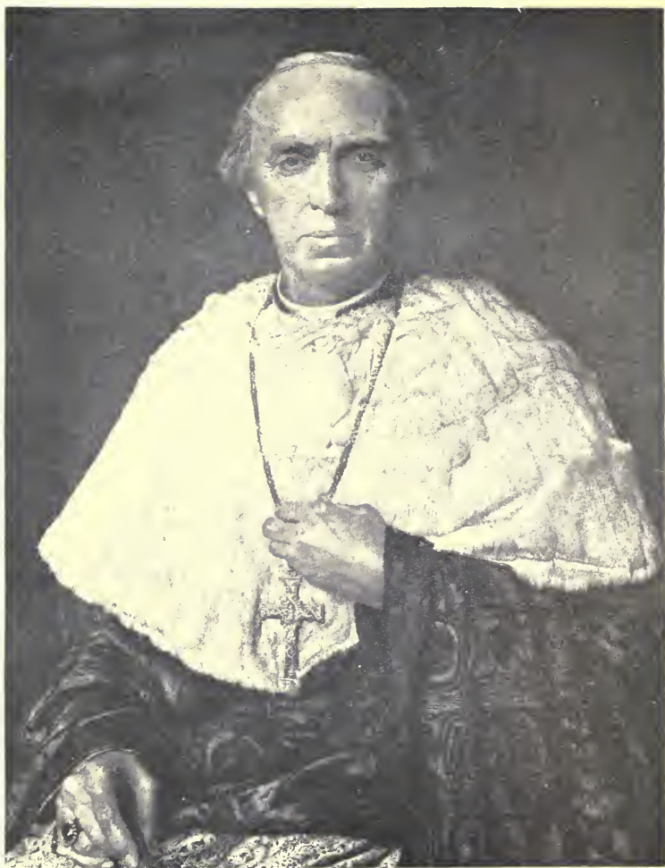
A facsimile of an etching of His Eminence, D. J. Cardinal Mercier.