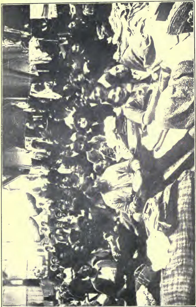
In Holland no railway station or public building near the frontier was without its hundreds of Belgian refugees glad to sleep on the bare floors.